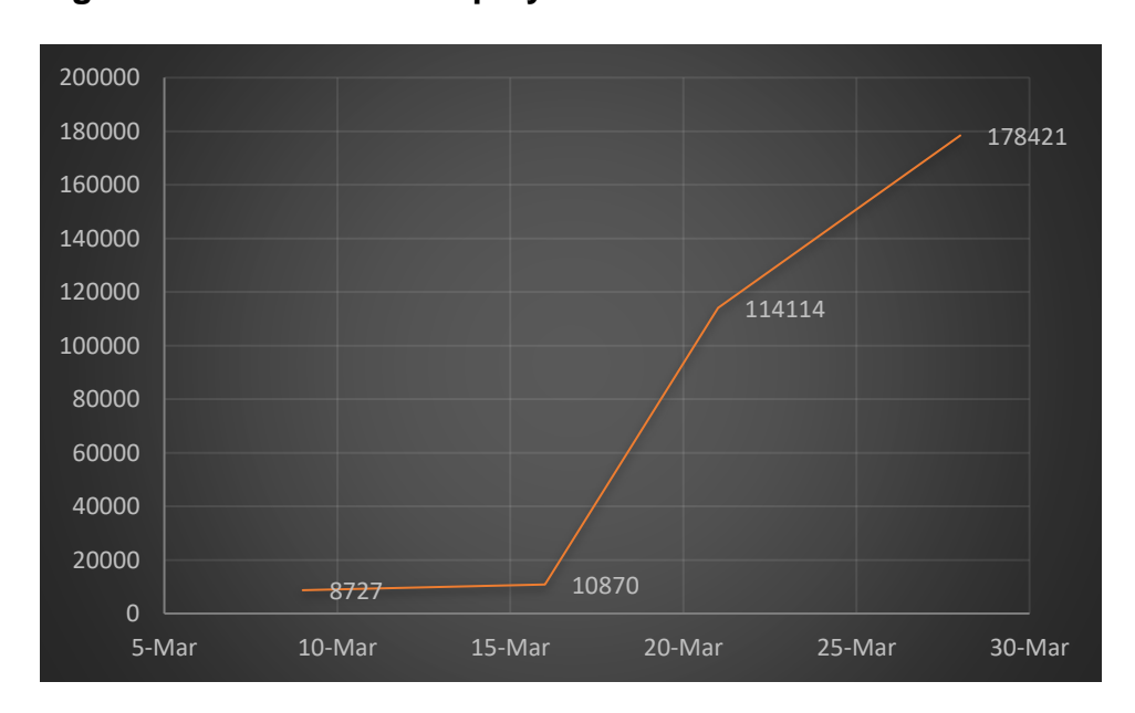
Figure 1: Growth in Unemployment Insurance Claims

A lead indicator for the looming economic crisis is number of people filing for unemployment insurance; the indicator for Illinois is increasing at the rate of 16% per day<sup>3</sup>, since March 9, 2020 (Figure 1).